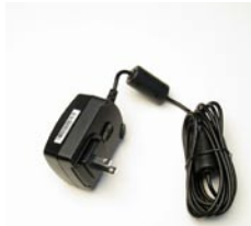
HHP7600 Power Supply #H15024