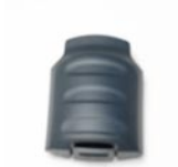
HHP7600 Spare Battery #H16103