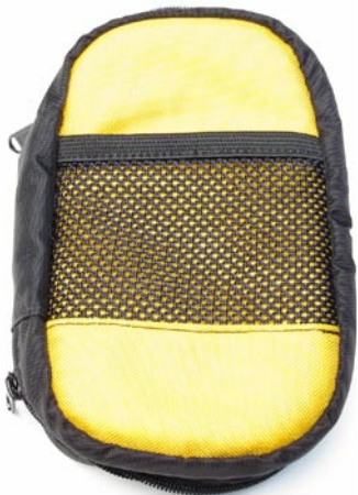
Cordura Pouch (For 7600) #H15007