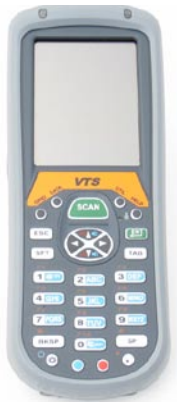
HHP 7600 Terminal #H15022