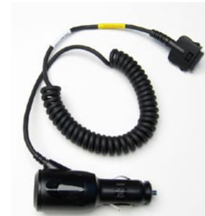
Vehicle Adapter #H15048

These Components are installed on HHP7600 at Hayton Systems.