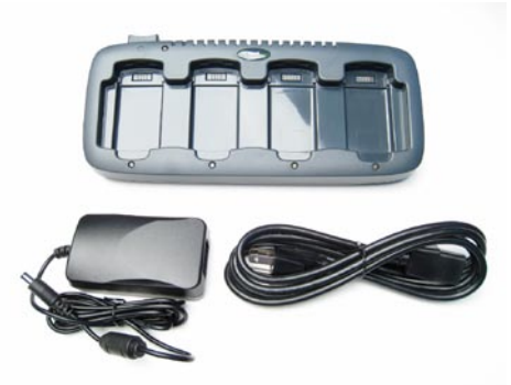
Quad Battery Charger w/power supply & power cord #H15041