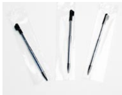
Stylus 3 Pack #H16108