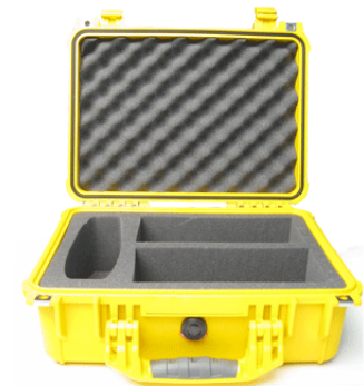
Hard Shell Case #H15501