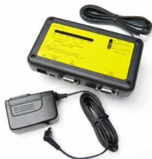
Combo Comm Box w/power supply #H19500