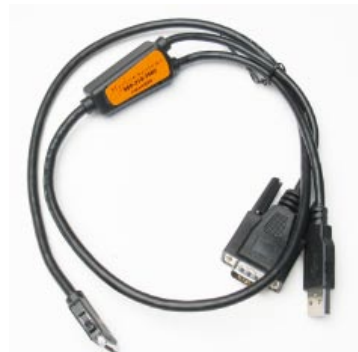
Custom USB/Serial Cable #H15029